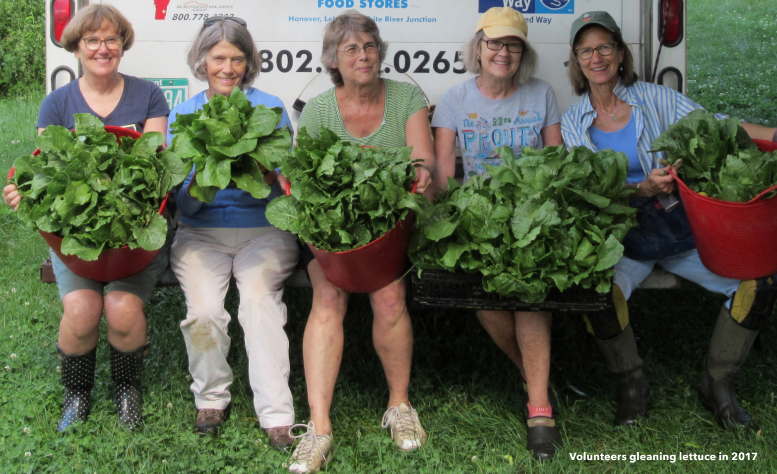
Volunteers gleaning lettuce in 2017