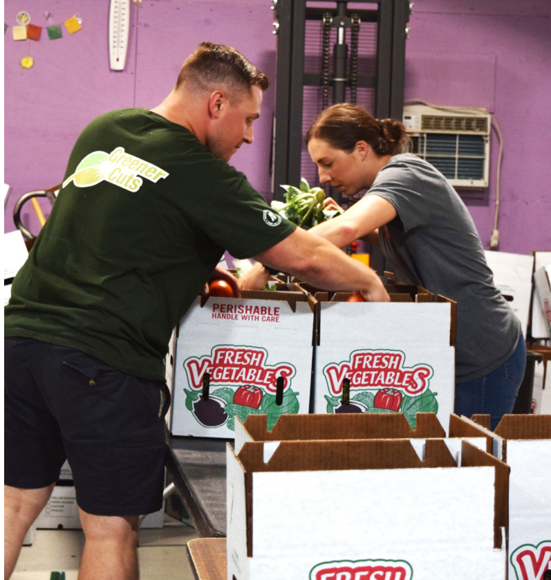
Volunteers prepare fresh food boxes for Veterans

“Being able to help provide our nation’s Veterans with healthy, locally sourced food for free is very rewarding. We not only got to help someone out by giving them delicious local vegetables, but we also got to spend time building community with fellow Veterans and Willing Hands employees!”