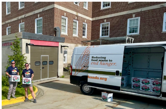
Delivering boxes to the VA

Veteran response to the weekly delivery of boxes of free, nutritious produce to the VA Medical Center has been positive. One Veteran said, “This is the best corn I’ve ever had!” We look forward to continuing our partnership with the VA Medical System to ensure Veterans continue to have access to fresh produce.